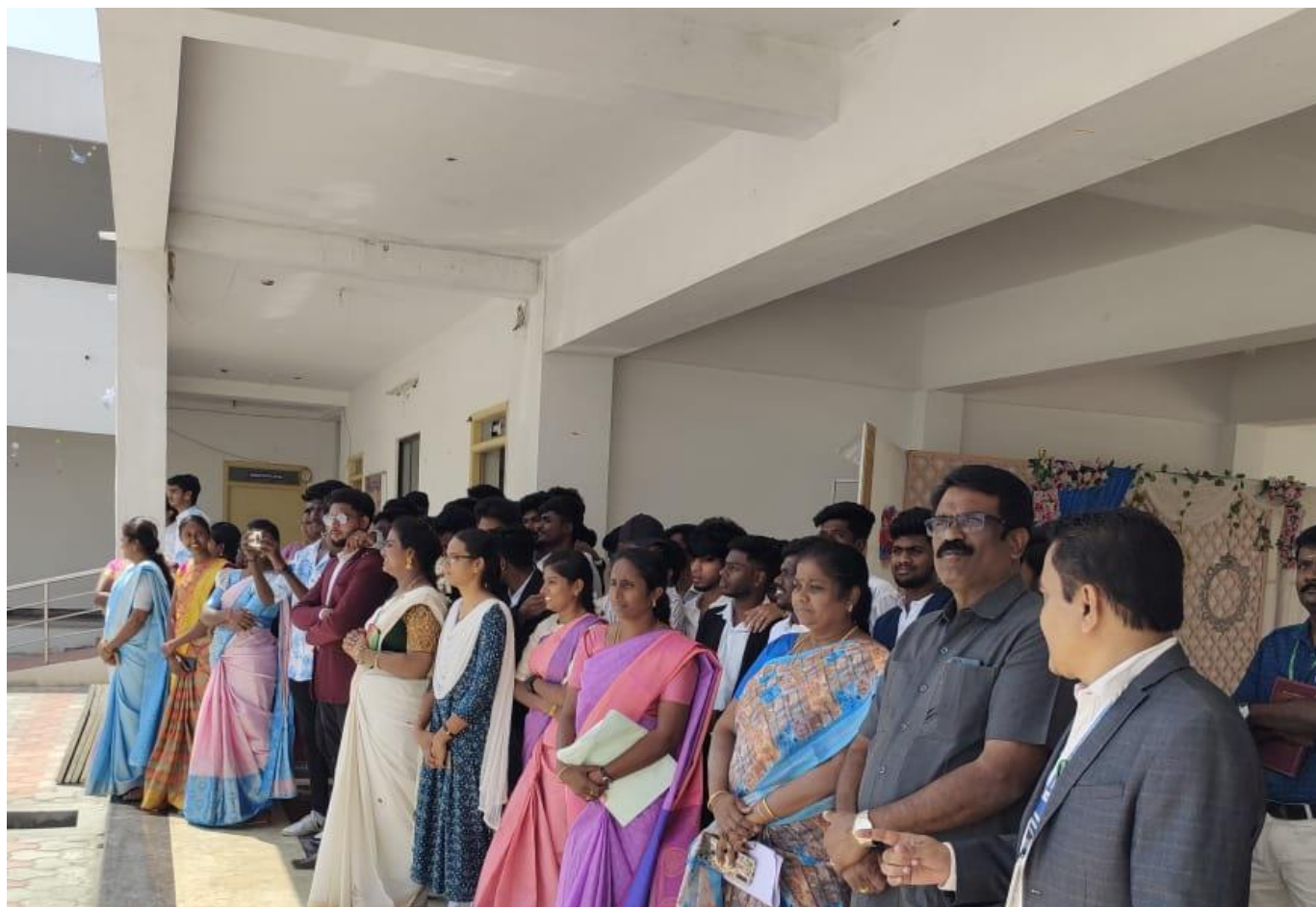
Womens day celebration

Approved by Tamilnadu Government & Pharmacy Council of India, New Delhi. Affiliated to the Tamilnadu Dr. M.G.R. Medical University, and The Directorate of Medical Education, Chennai.