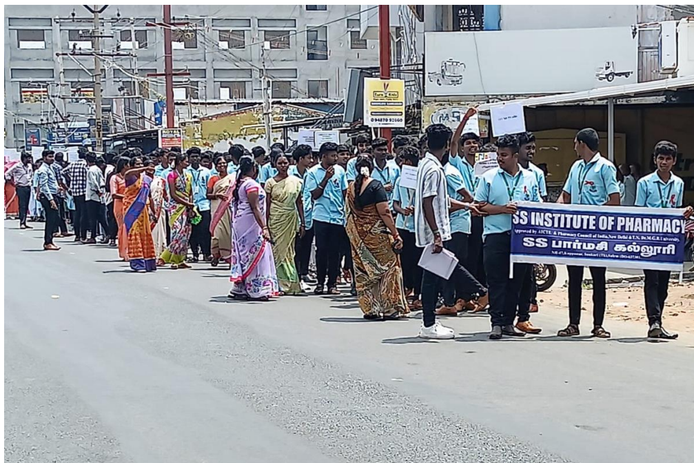
Rally for Healthier world

Approved by Tamilnadu Government & Pharmacy Council of India, New Delhi. Affiliated to the Tamilnadu Dr. M.G.R. Medical University, and The Directorate of Medical Education, Chennai.